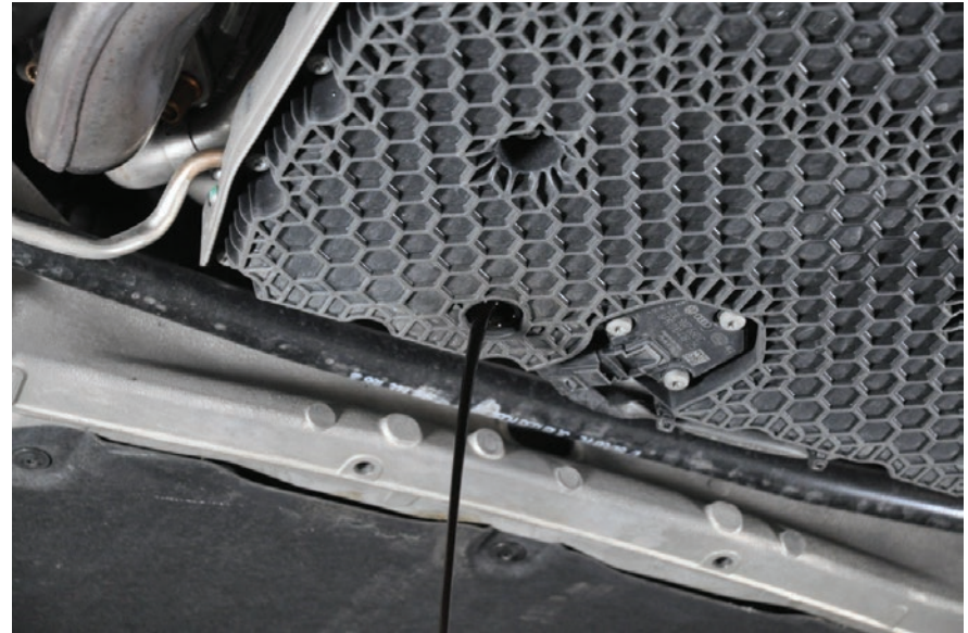
3 Remove all fasteners from the oil pan. Be careful to not spill remaining oil in the pan. Replacing the drain plug will help keep oil from running out.