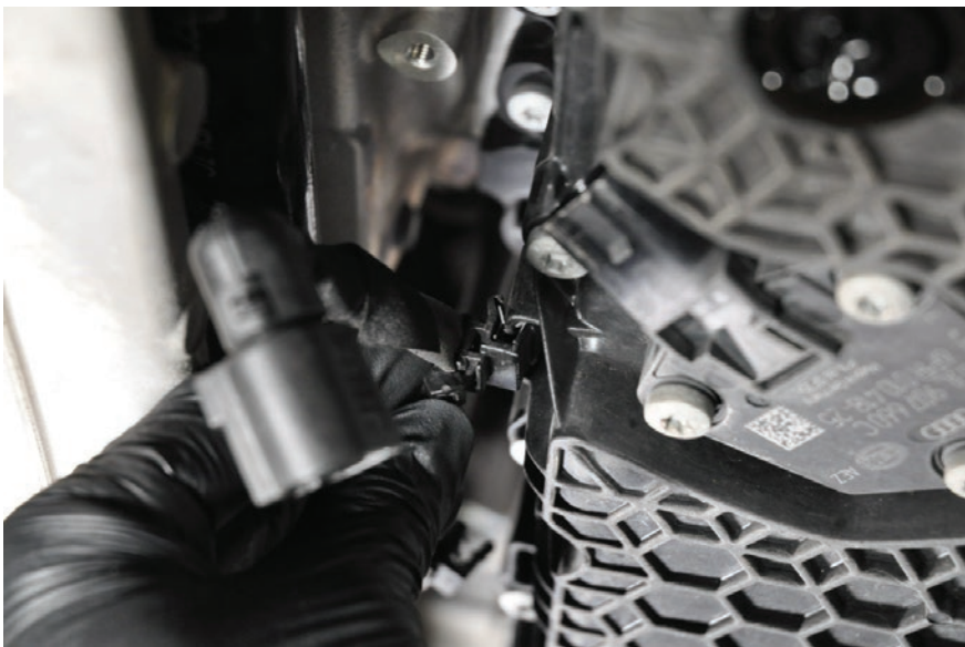
2 Unplug the oil level sensor and unclip it from the oil pan. Tuck this out of the way.